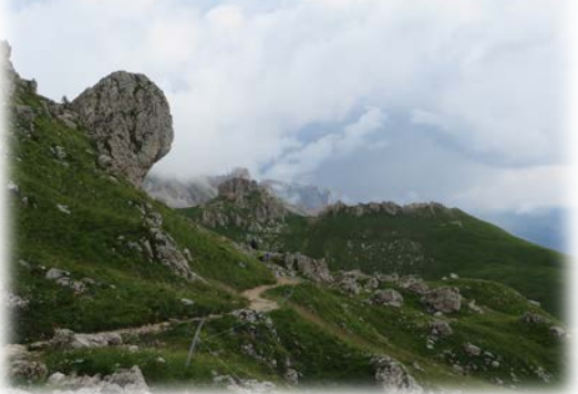
Breathtaking scenery as we hike.