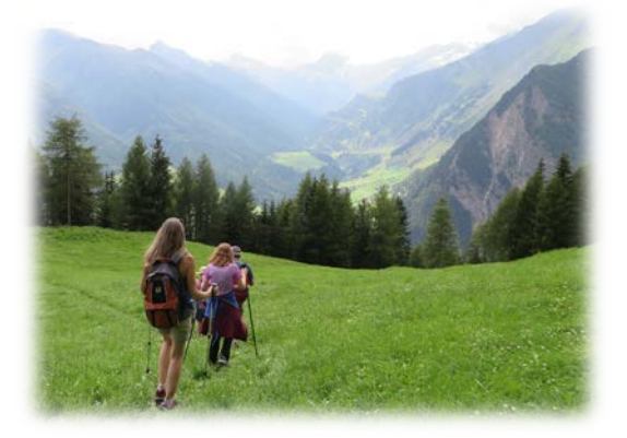
Time to go back!

<u>Wednesday, October 11<sup>th</sup></u> After breakfast from the buffet, we check out of the hotel and travel to the village of Nova Levante in Alto Adige's Dolomites . Upon arrival, we'll be treated to an exclusive cooking class with the delightful Michelin-Star Chef Theodor Falser , followed by lunch. In the afternoon we check into the charming Hotel Rosengarten at the edge of the forest outside Nova Levante. After a short hike , we can relax and freshen up before dinner at the hotel. Overnight Hotel Rosengarten in Nova Levante.