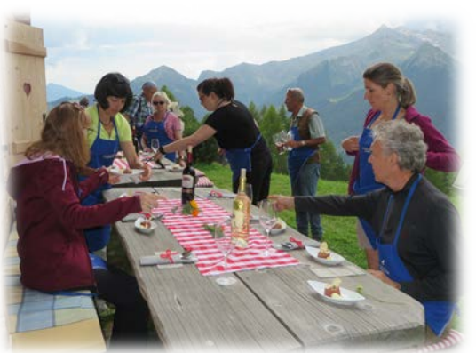
Ready for our first course!