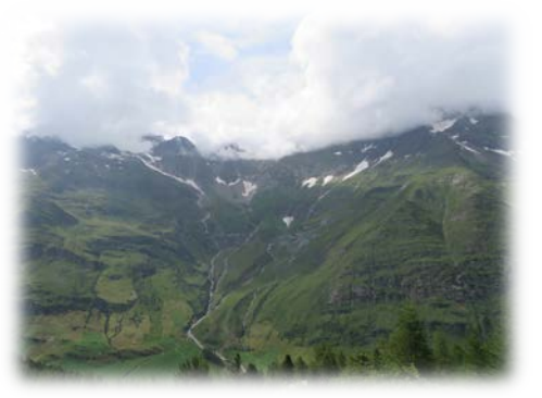
Scenic hiking in the mountains!