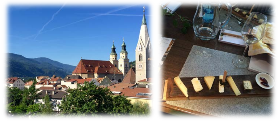
Charming town of Bressanone

Saturday, October 14<sup>th</sup> After breakfast from the buffet, we check out of our hotel and stop at the lovely town of Bressanone (Brixen) for some free time. We then are given an unforgettable and educational cheese sampling lunch snack before continuing our transfer to the picture-perfect town of Landshut in Bavaria. After checking into the hotel and enjoying a walk along the historic main street we'll enjoy a classic Italian dinner at a nearby restaurant. Overnight Landshut, Bavaria.