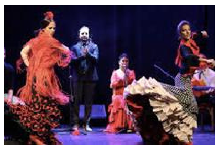
Flamenco Performance in Barcelona

A perfect accompaniment to its excellent cuisine, the wines of northeast Spain reared in Rioja, Navarra, Rivera del Duero and the Penedes regions have increasingly gleaned international recognition as counting among Spain's best.