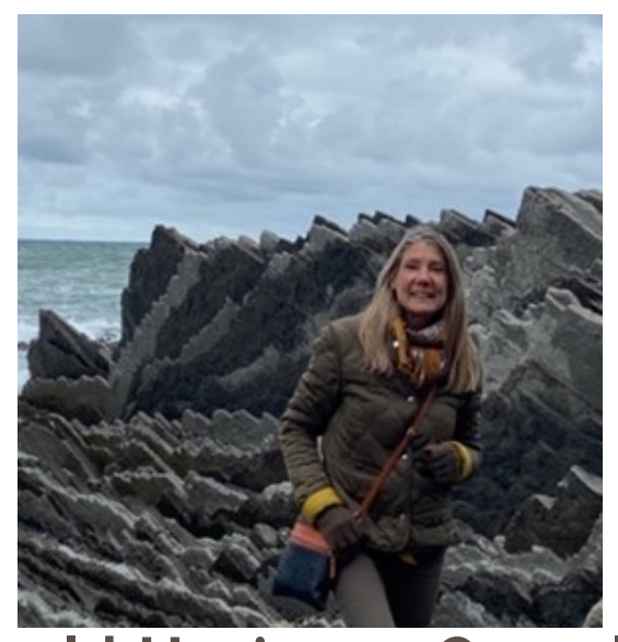
World Heritage Coastline