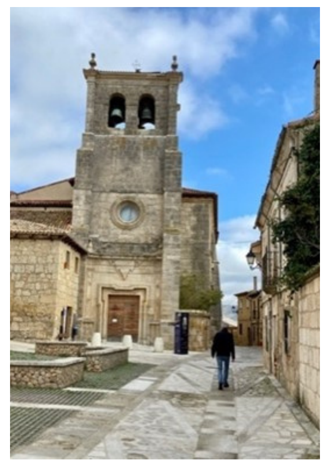
On Saint James's Way