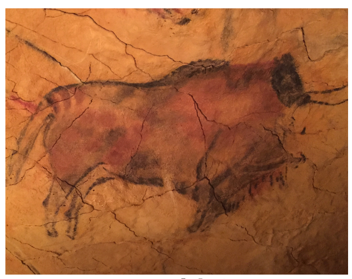
36,000-yr-old Cave Art