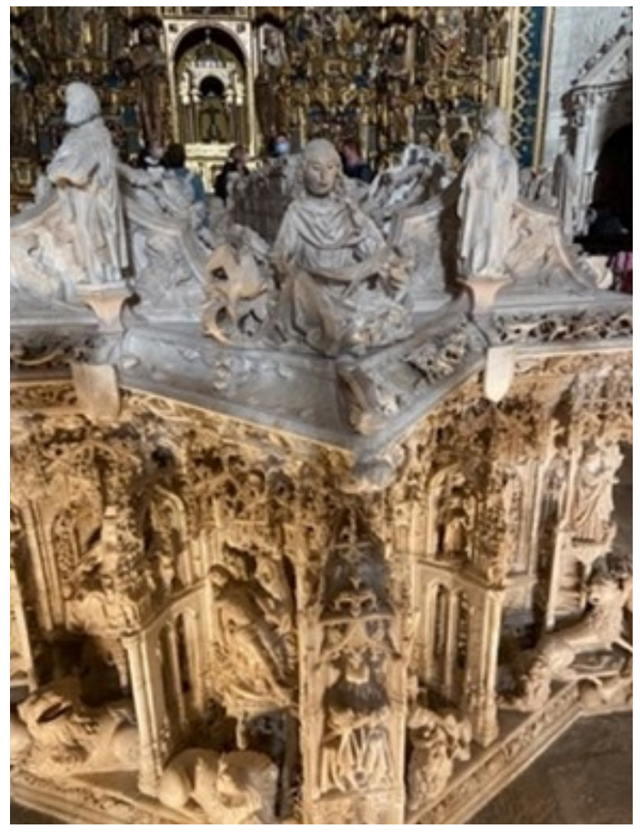
Burgos Art Treasure